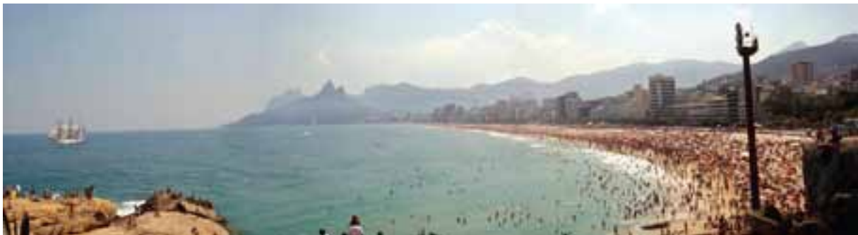
How about heading off to a holiday in Rio De Janeiro?